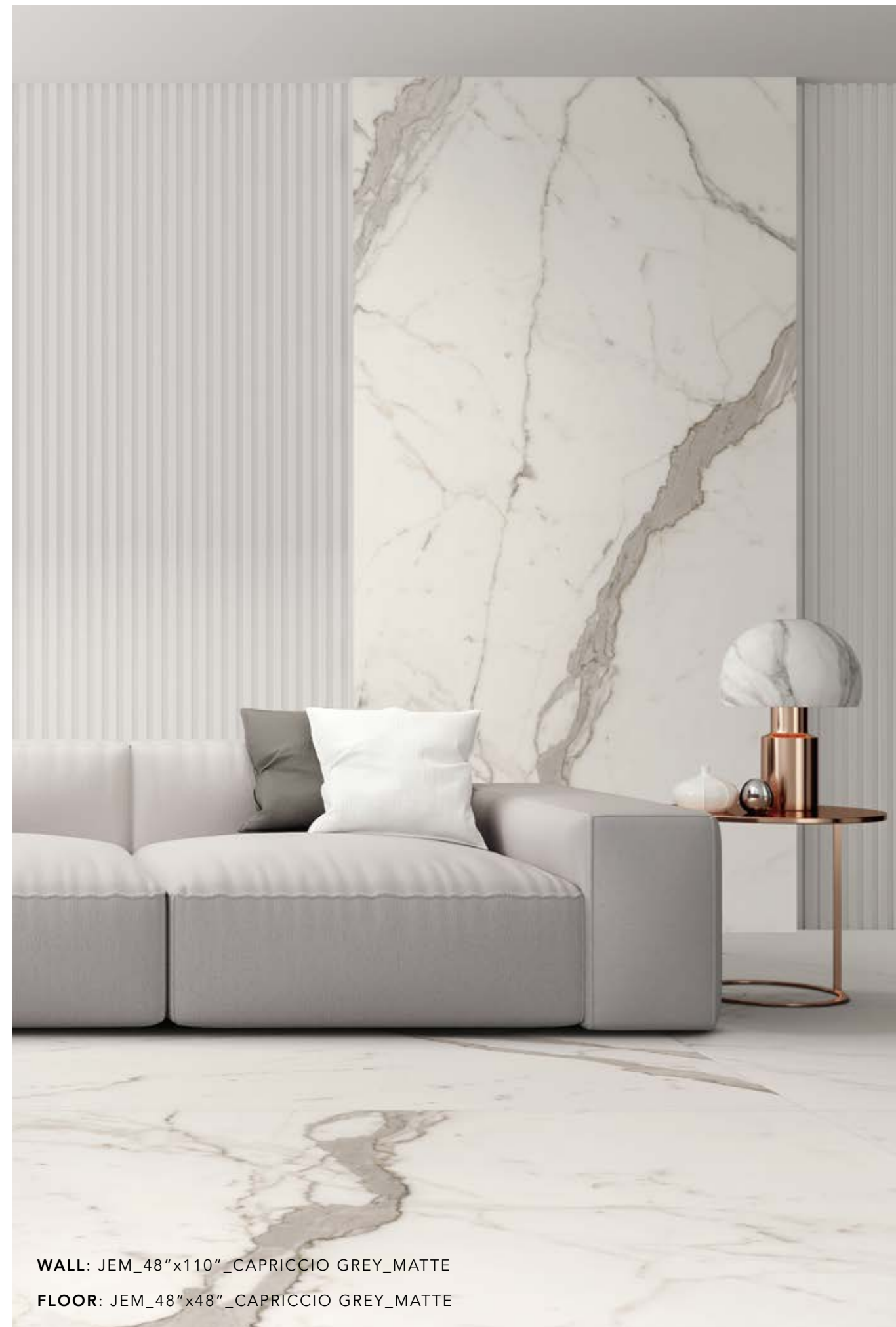
WALL: JEM_48"x110" _CAPRICCIO GREY_MATTE