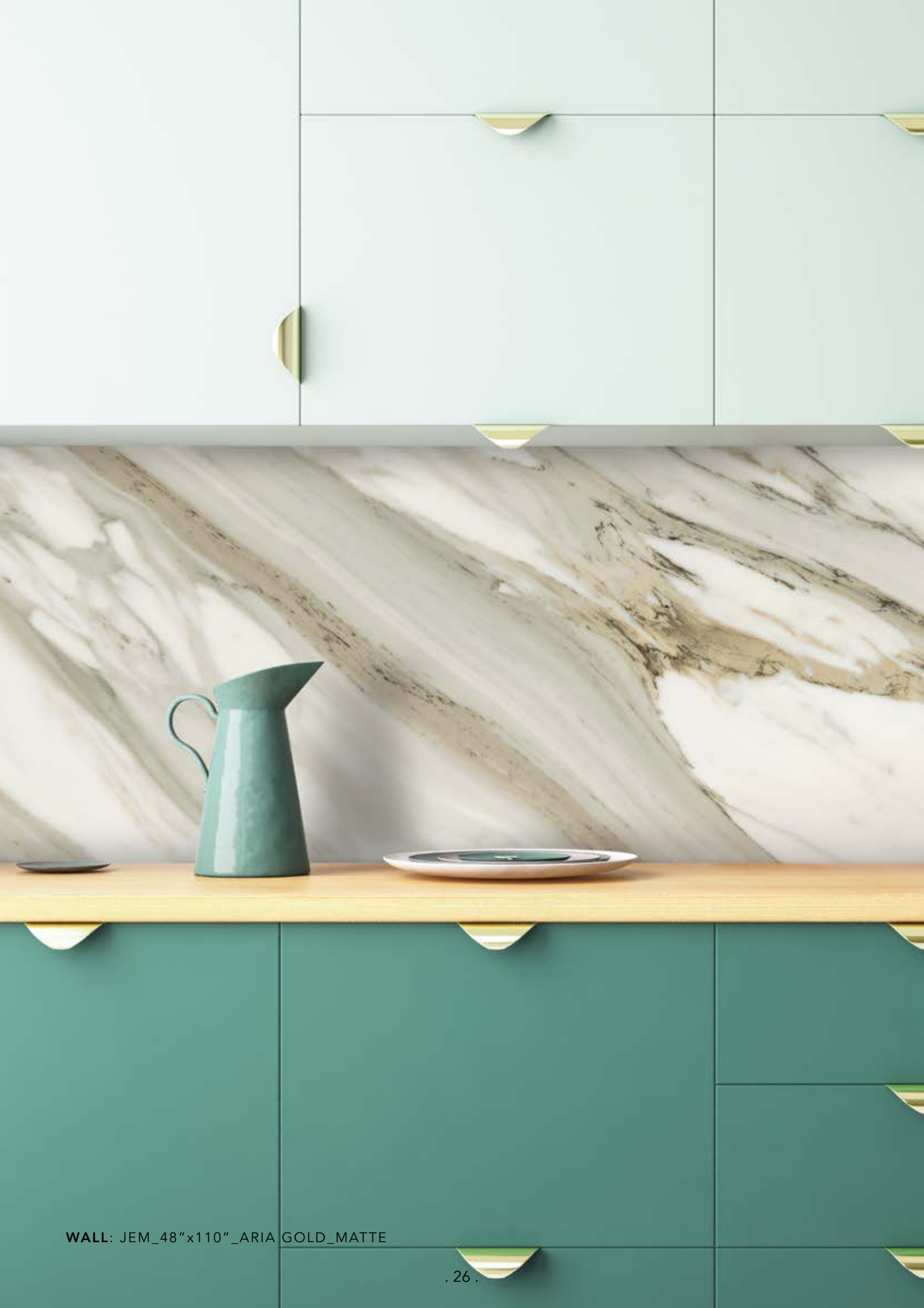
WALL: JEM_48"x110" _ARIA GOLD_MATTE