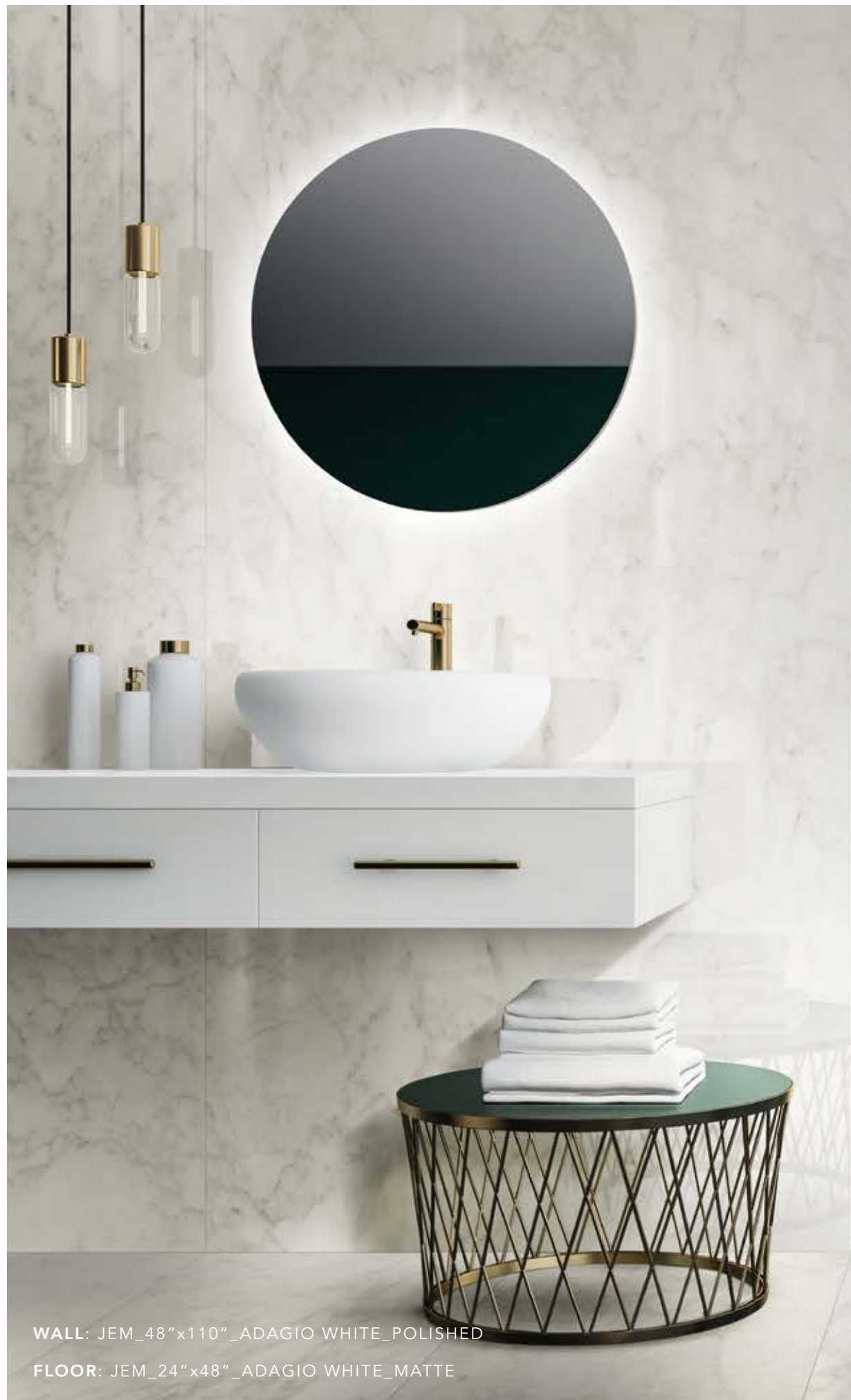
WALL: JEM_48"x110"_ADAGIO WHITE_POLISHED