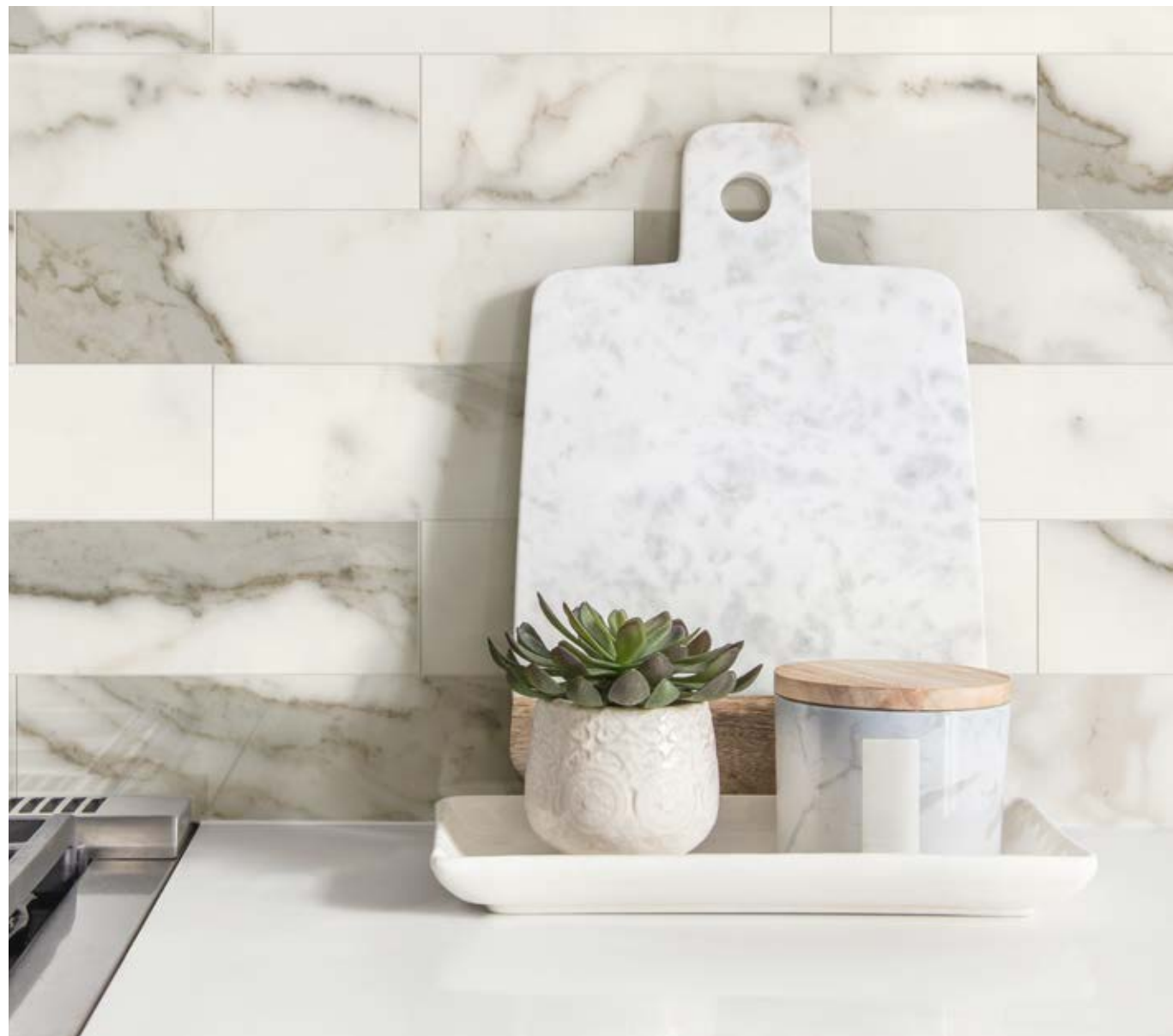
WALL: JEM_3"x12" _CAPRICCIO GREY_POLISHED