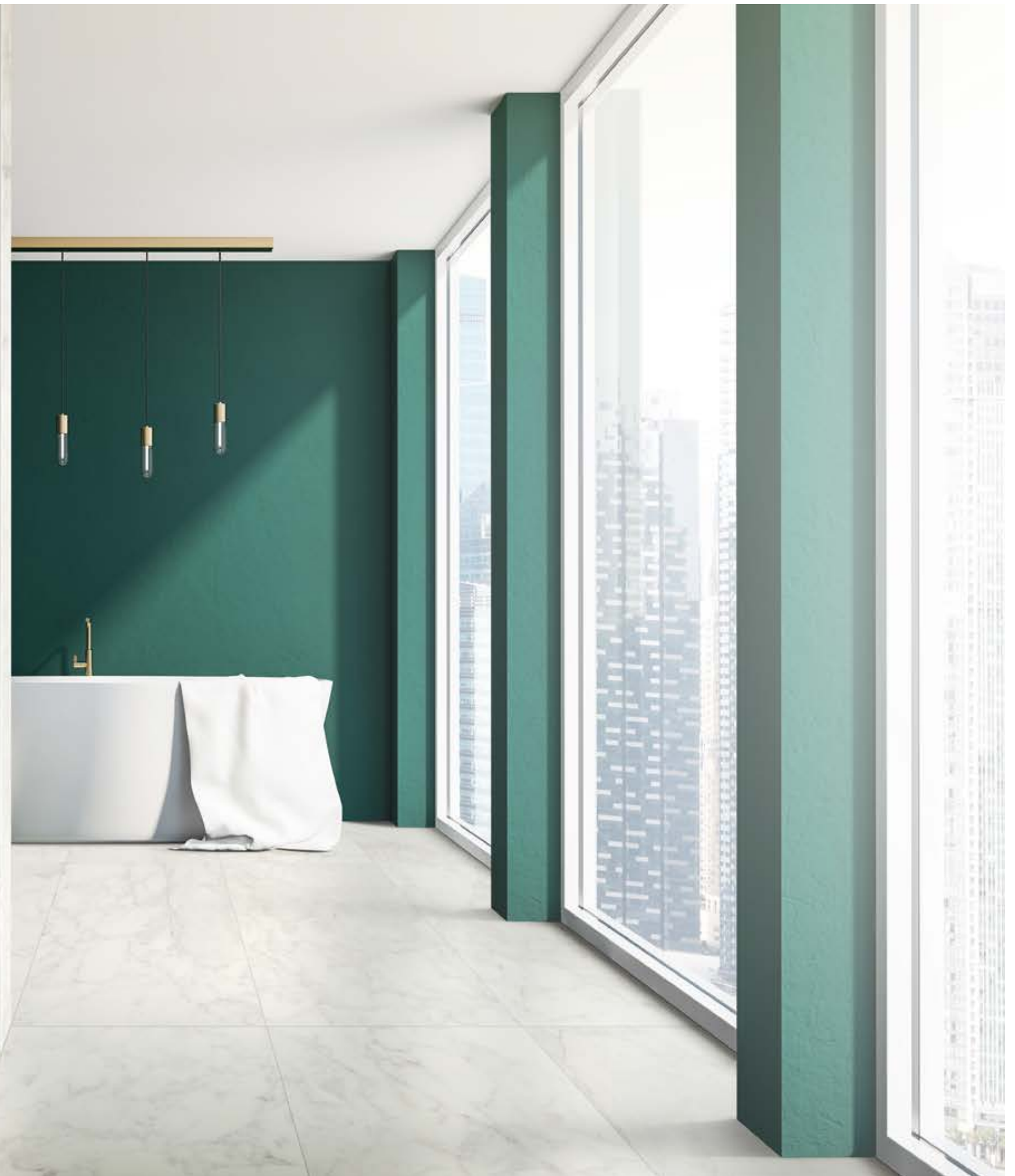
FLOOR: JEM_24"x48"_ADAGIO WHITE_MATTE