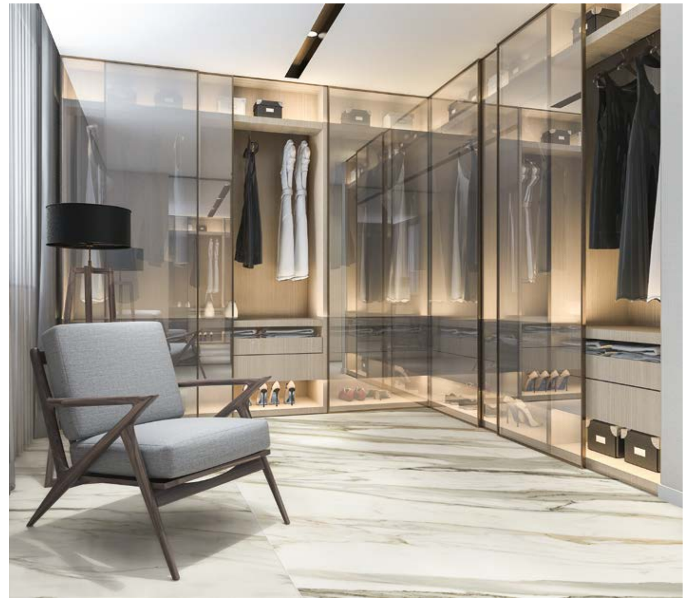
FLOOR: JEM_48"x48" _ARIA GOLD_MATTE